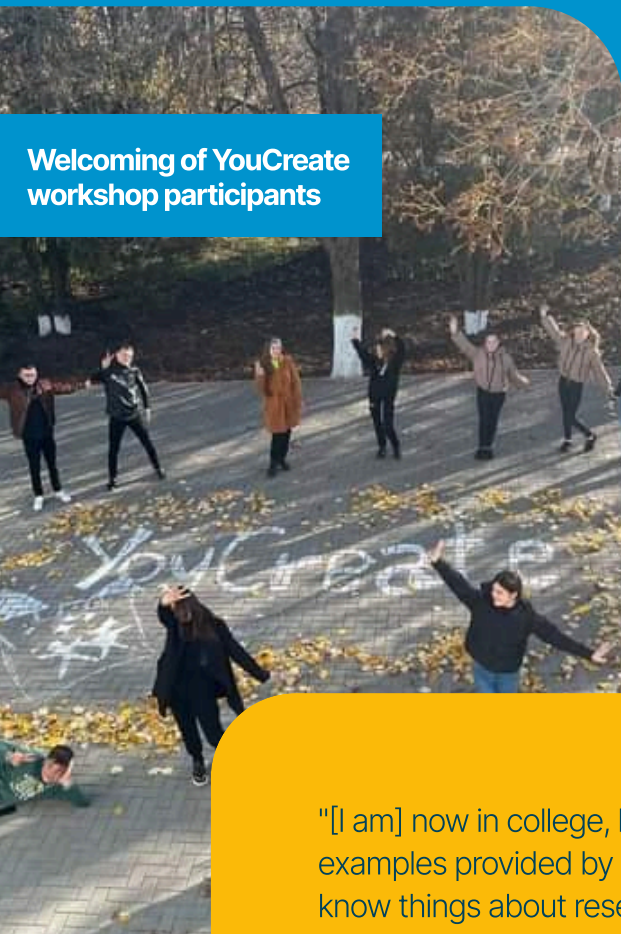
Welcoming of YouCreate workshop participants

One of CASTLE's most effective approaches was involving children as co-researchers in a study about transnational families, ensuring that the perspectives of 'children left behind' were at the forefront of policy recommendations. For a young Moldovan project participant whose parents worked abroad during her childhood, this approach was transformative. As a co-researcher, she explored the complexities of life as part of a transnational family, uncovering both personal insights and professional inspiration.