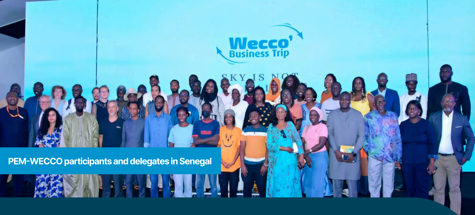
PEM-WECCO participants and delegates in Senegal