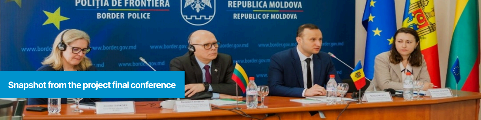
Snapshot from the project final conference