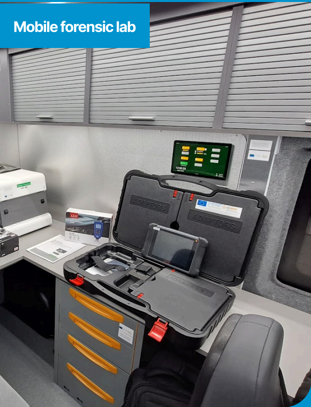
Mobile forensic lab

The project upgraded the forensic lab of the Moldovan Border Police and provided officers with modern tools for document examination and car scanning. The acquisition of a mobile forensic lab, informally known as the Schengen Bus, marks a notable upgrade to Moldova Border Police's capacity to scrutinise the validity of travel documents. This mobile lab enables officers to travel to various locations and conduct examinations on the spot, significantly reducing investigation time and improving case resolution. Additionally, it serves as a valuable training tool.