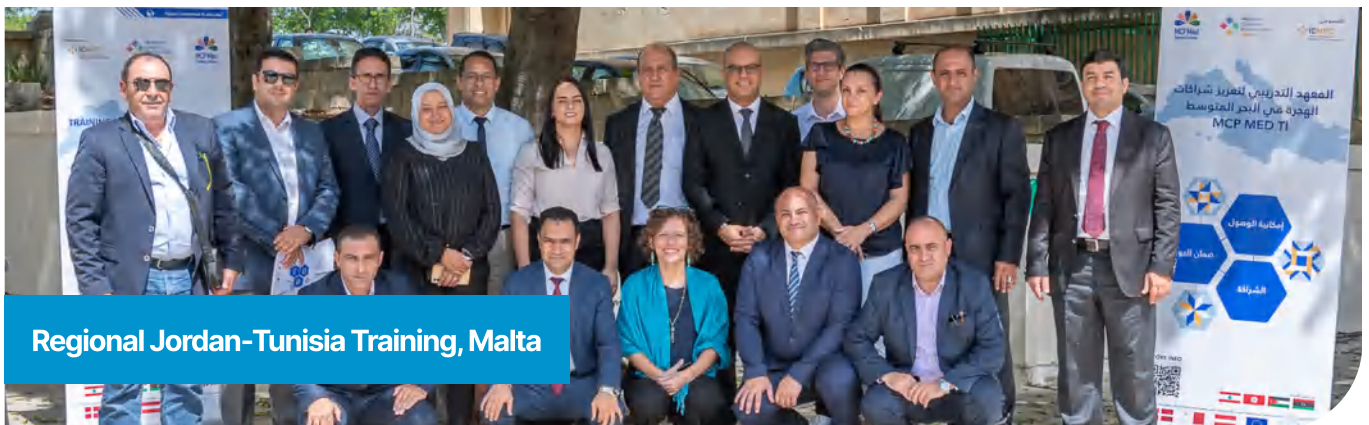
Regional Jordan-Tunisia Training, Malta

"It was a valuable experience... a chance to learn from participants from different countries." (Trainee, Migration Policy Development Training)