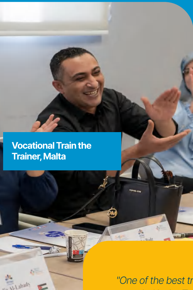
Vocational Train the Trainer, Malta

The Training Institute delivers EU-accredited training in local languages to migration professionals across the Mediterranean through a network of national trainers. The Institute operates 13 licensed premises in seven countries. Over 735 migration professionals have gained EU-recognised qualifications; 520 received formal certificates through 24 accredited courses in migration governance, border management, and professional development. Ongoing needs analysis with Southern partner countries, who hold equal Governing Board voting rights, keeps the 51-course portfolio aligned with regional priorities.