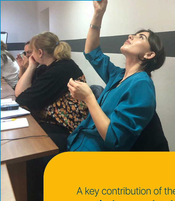
Participants of training on document fraud detection

Through 14 training sessions, European police officers from France, Italy, Latvia and Spain brought up-to-date operational practices directly to Georgian officers. The sessions focused on the latest trends in document fraud and behavioural analysis. Through practical exercises and real-life examples, Prometheus II helped officers strengthen skills they use every day, from spotting forged documents to identifying potential trafficking risks. More than 90% of the 225 officers trained said the training helped them perform their duties more effectively.