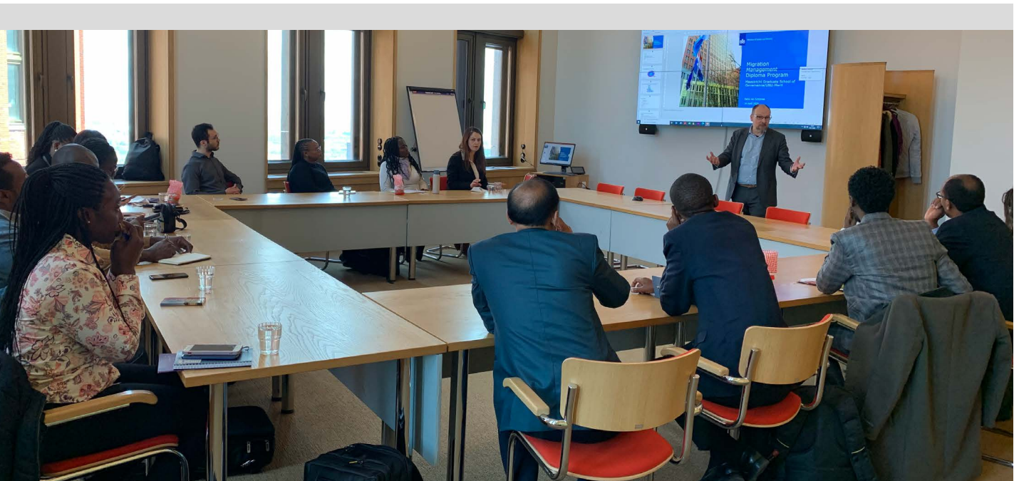
Field Trip to The Hague, The Netherlands – Dutch Ministry of Security and Justice, 26 April 2023

A total of 58 civil servants and policy practitioners working in the area of migration and coming from MP and CAMM countries were trained in the three cohorts organised through the MMDP program. Country analyses and the identification of tailored candidate profiles during the inception phase allowed to target participants who are best positioned within their national governance systems to support dialogue between the EU and partner countries, as well as other priority countries that may amplify or benefit from the development impacts of migration.