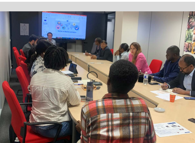
Field Trip to Brussels, Belgium – DG HOME, 21 June 2023