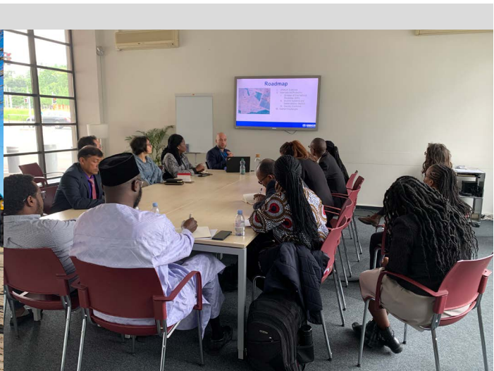
Field Trip to Geneva, Switzerland – UNHCR HQ, 24 May 2023