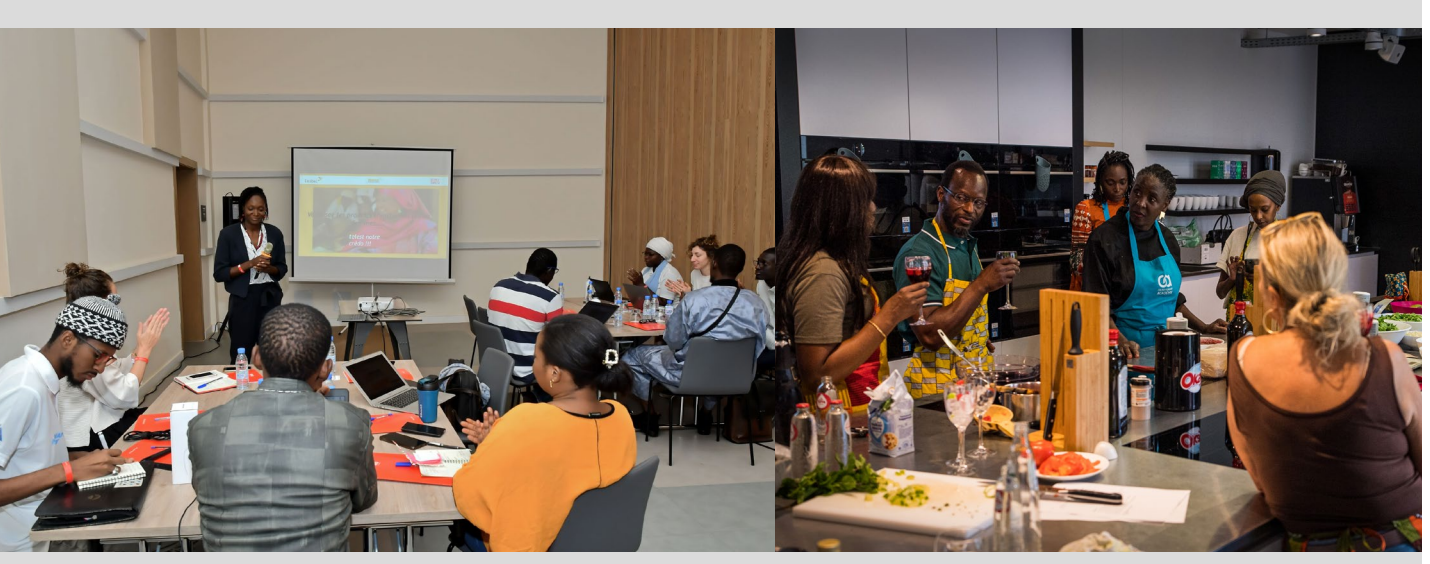
First Boostcamp, Mbour, Senegal, 15 December 2022.

Upon arrival in Belgium, Senegalese professionals engaged in learning and exchange itineraries with Belgian companies and business incubators, with the aim of creating cross-country partnerships between economic and business support actors. These partnerships were intended to support the creation, incubation, acceleration, and internationalisation of businesses in Senegal.