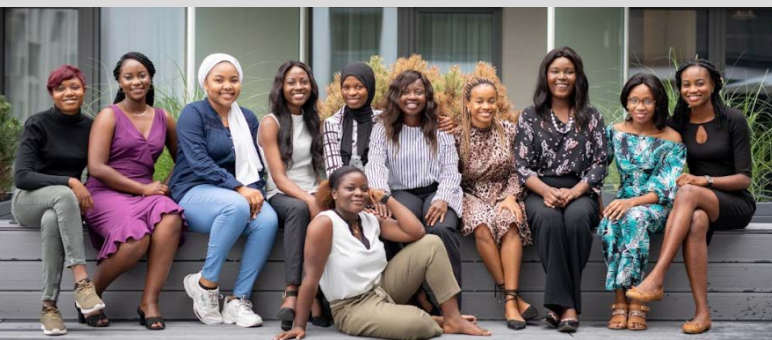
Second track participants in Vilnius, Lithuania, July 2021.

The migration context between Lithuania and Nigeria was analysed to inform the programme's design and to contribute to strengthening labour migration relations between the two countries. This activity supported the temporary migration of selected Digital Explorers and their integration into the Lithuanian ICT labour market and society and ensured that their professional development goals were met.