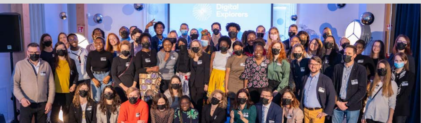
Project closing event in Vilnius, Lithuania, December 2021.

The Digital Explorers project also directly contributed to TeleSoftas opening a branch office in Nigeria - a form of foreign direct investment that will likely lead to local job creation in the short and medium term. TeleSoftas is among the Lithuanian companies participating in the project that hired the first track of Explorers.