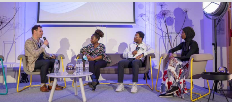
Interview with Digital Explorers programme participants in Vilnius, Lithuania, December 2021.