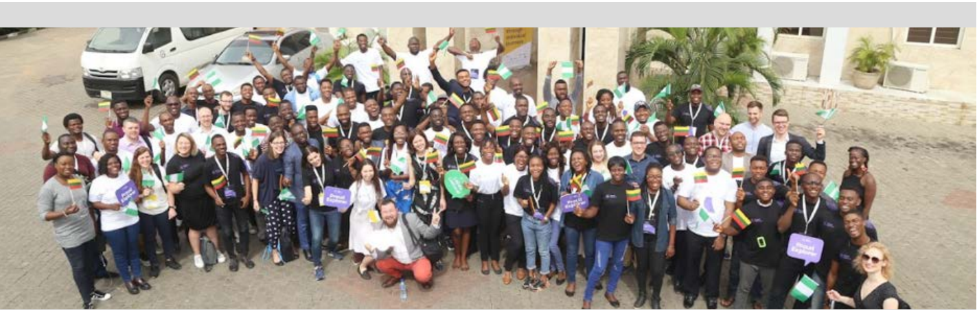
Hackathon held in Abuja, Nigeria, for the selection of Digital Explorers, May 2019.