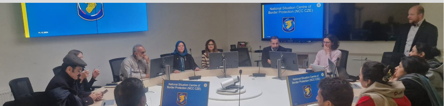
Prague, Czechia, December 2024: Study visit of Risk Analysis Unit members to Czech National Situation Centre of Border Protection