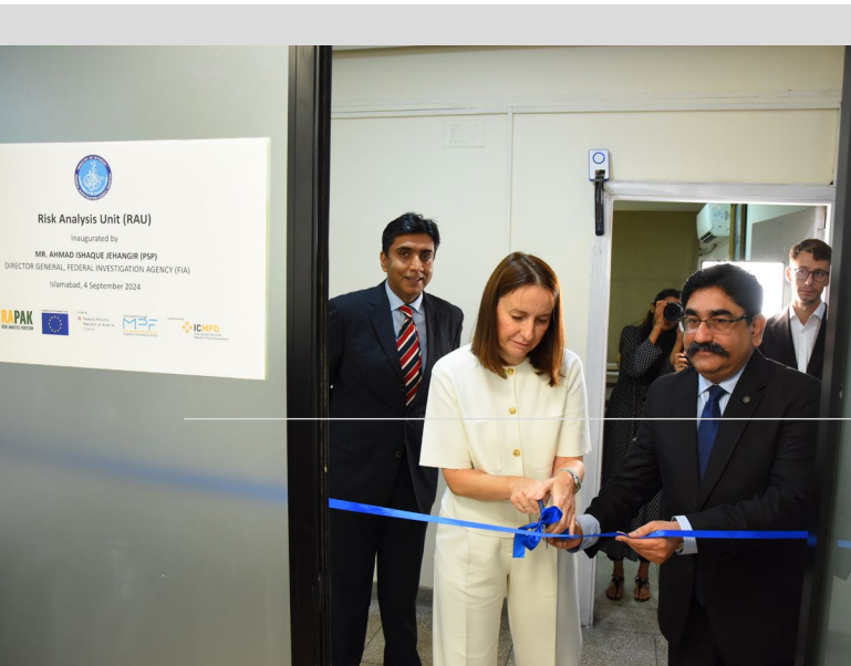
Islamabad, September 2024: Official inauguration of the Risk Analysis Office in the FIA headquarters by the FIA Director General, representatives of the European Union Delegation to Pakistan and ICMPD