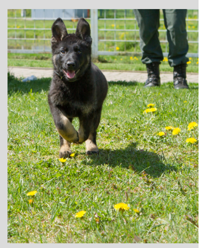
Newly donated pup to be trained for border control and contribute to gene pool in Georgia (May 2017).