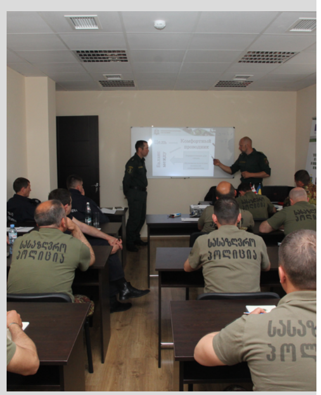
Workshop on the methodology for selection, training and use of service dogs for dog handlers in Georgia (May 2017).