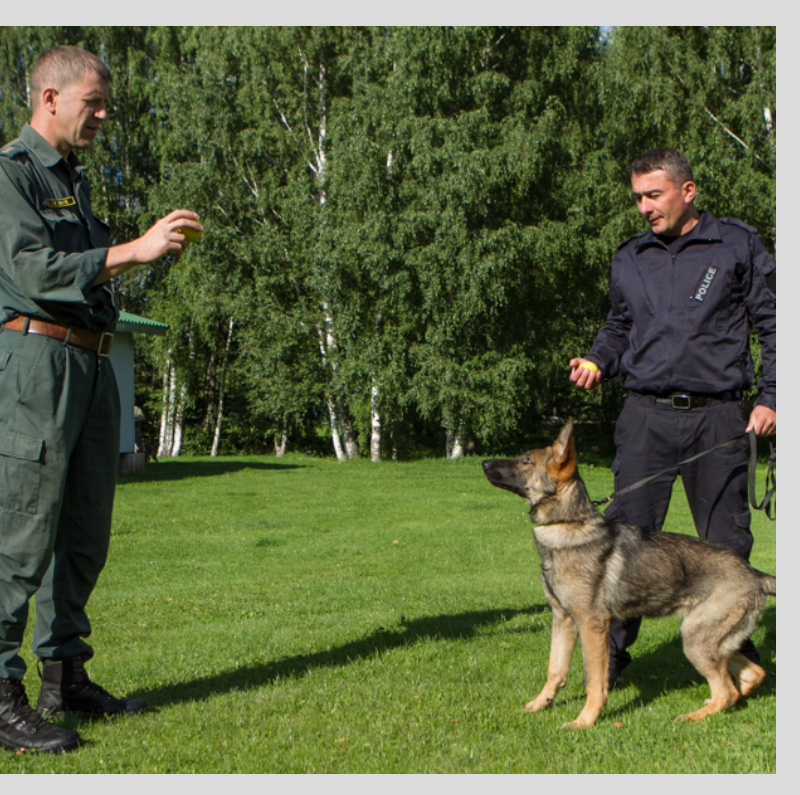
Dog handling training for border guard instructors from the Republic of Moldova and Georgia (Latvia August 2017).